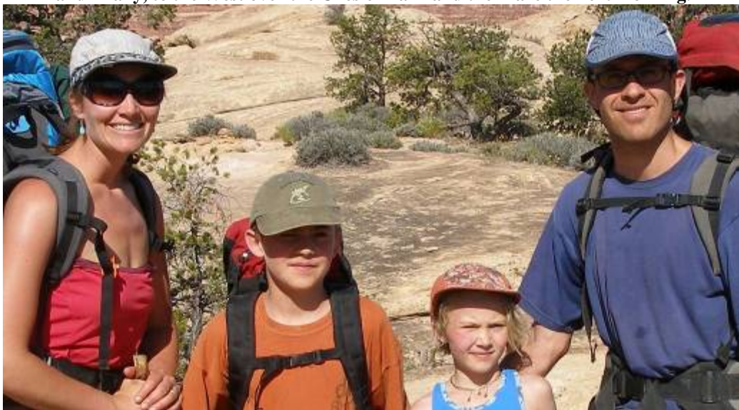
On the hike out the last day.