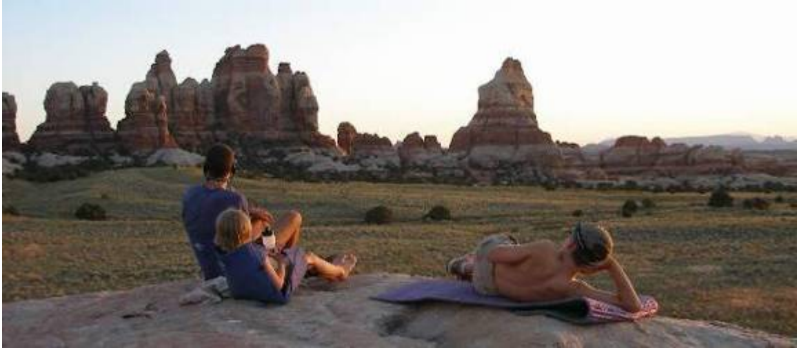
And the view from camp: to the South,