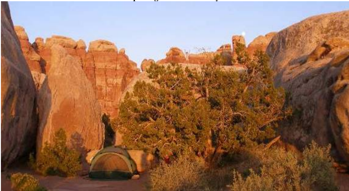
Our Chesler Park camp site (CP2) on the third night.