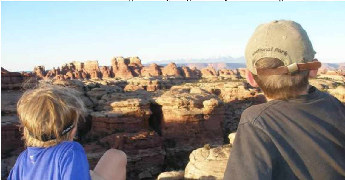
The La Salle Mountains (again) from a perch above our EC1 camp.