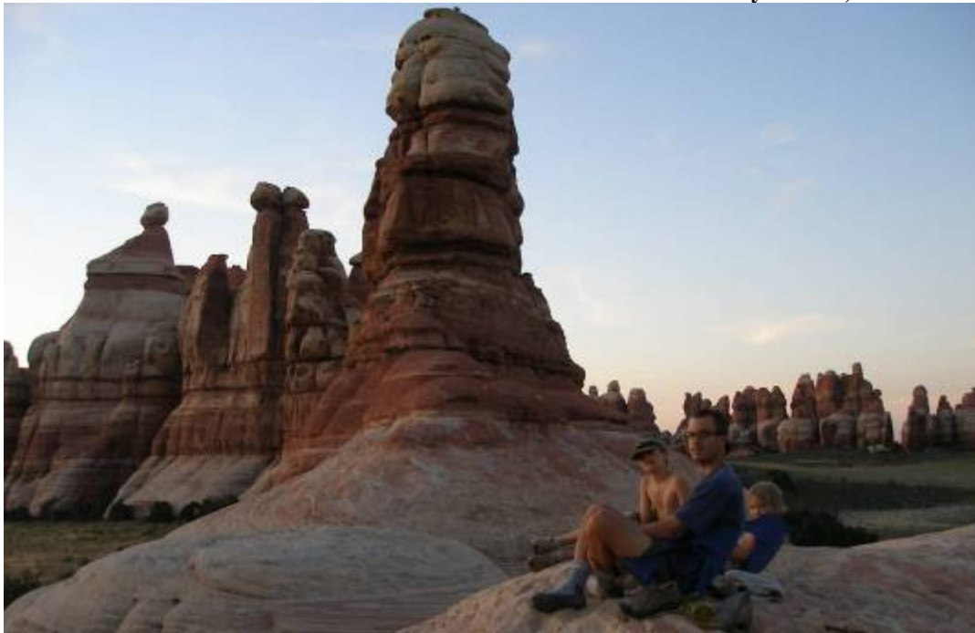
to the North