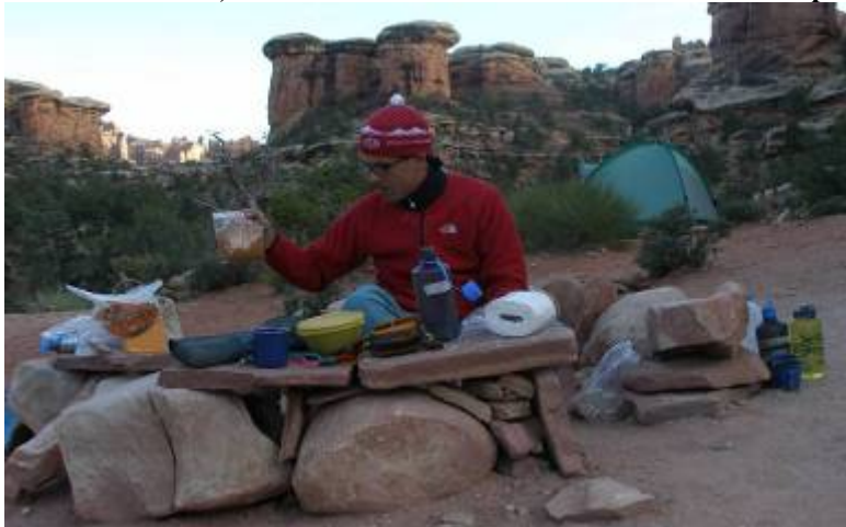
Elephant Canyon 1 (EC1) backcountry camp site, where we stayed for two nights.