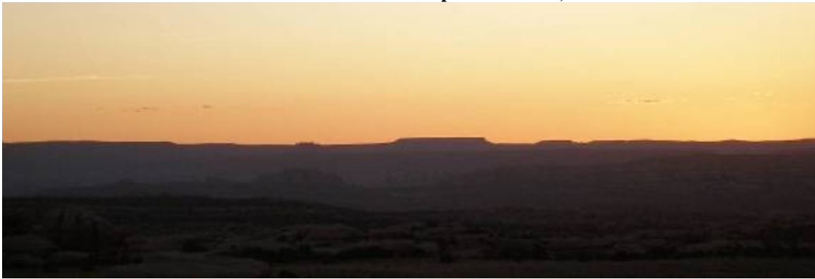
to the West over Chesler Park and the Maze District of Canyonlands,