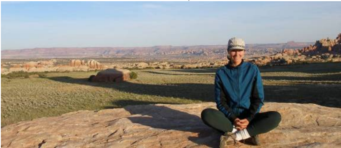
and finally, to the West over the Chesler Park and the Maze the next morning.