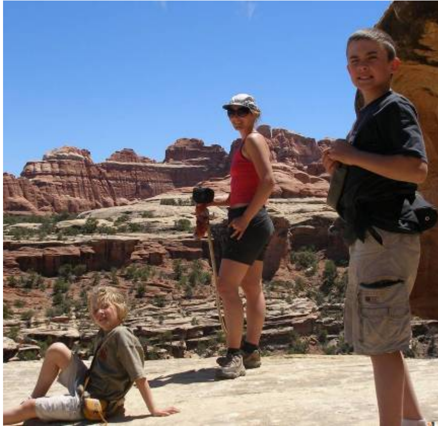
Exploring near EC1 on Day 2.