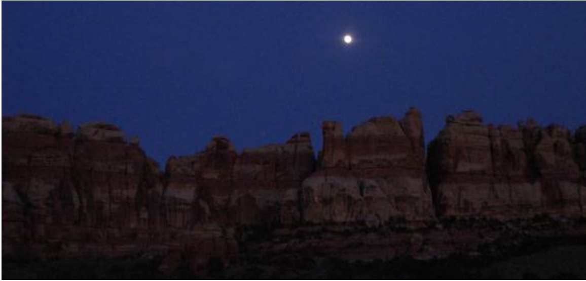
to the East,