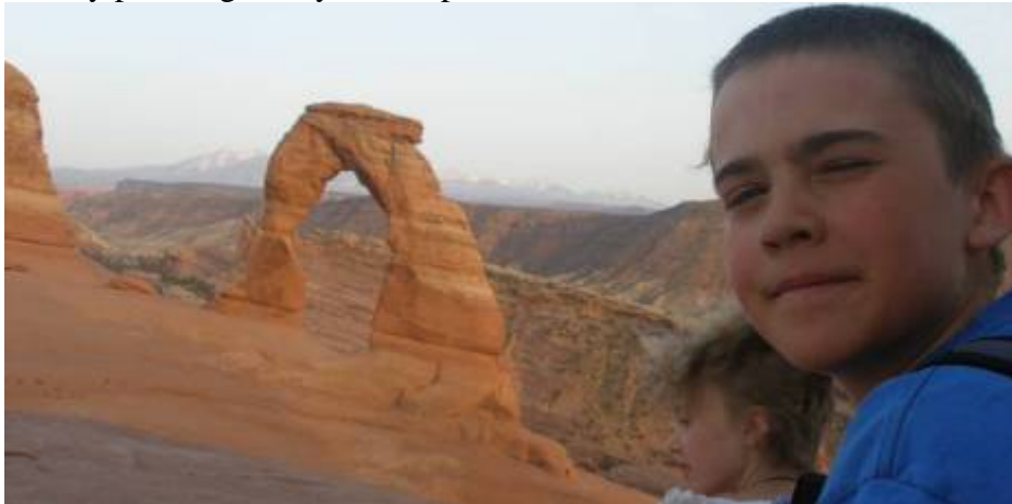
The kids and Delicate Arch in Arches National Park with the La Salle Mountains beyond.